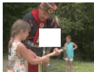
Top Activities in Indianapolis, Indiana