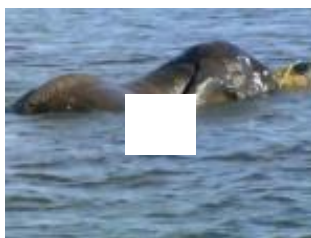
Watching Elephants in Capirivi, Namibia